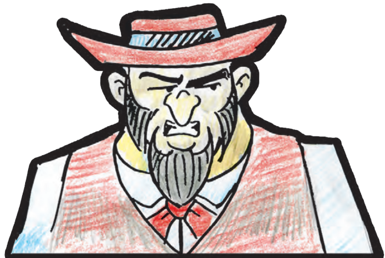
Horace Jones: Likes watercolors and kitty cats