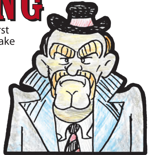
Sly Malone: Just in from Chicago, Sly is the fastest draw this side of the street.